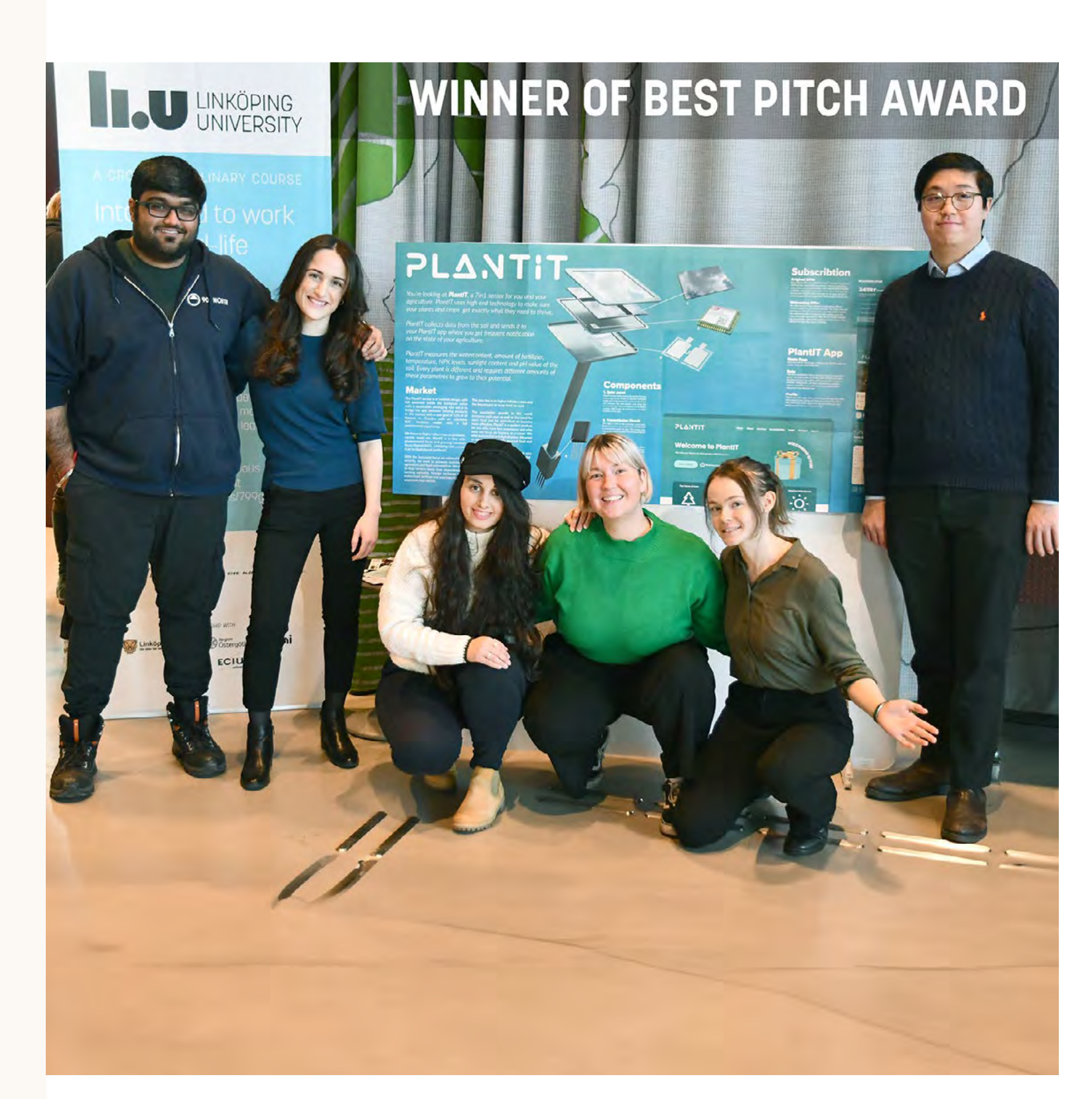
Plantit, the student team who won best pitch award in the autumn 2022 course.