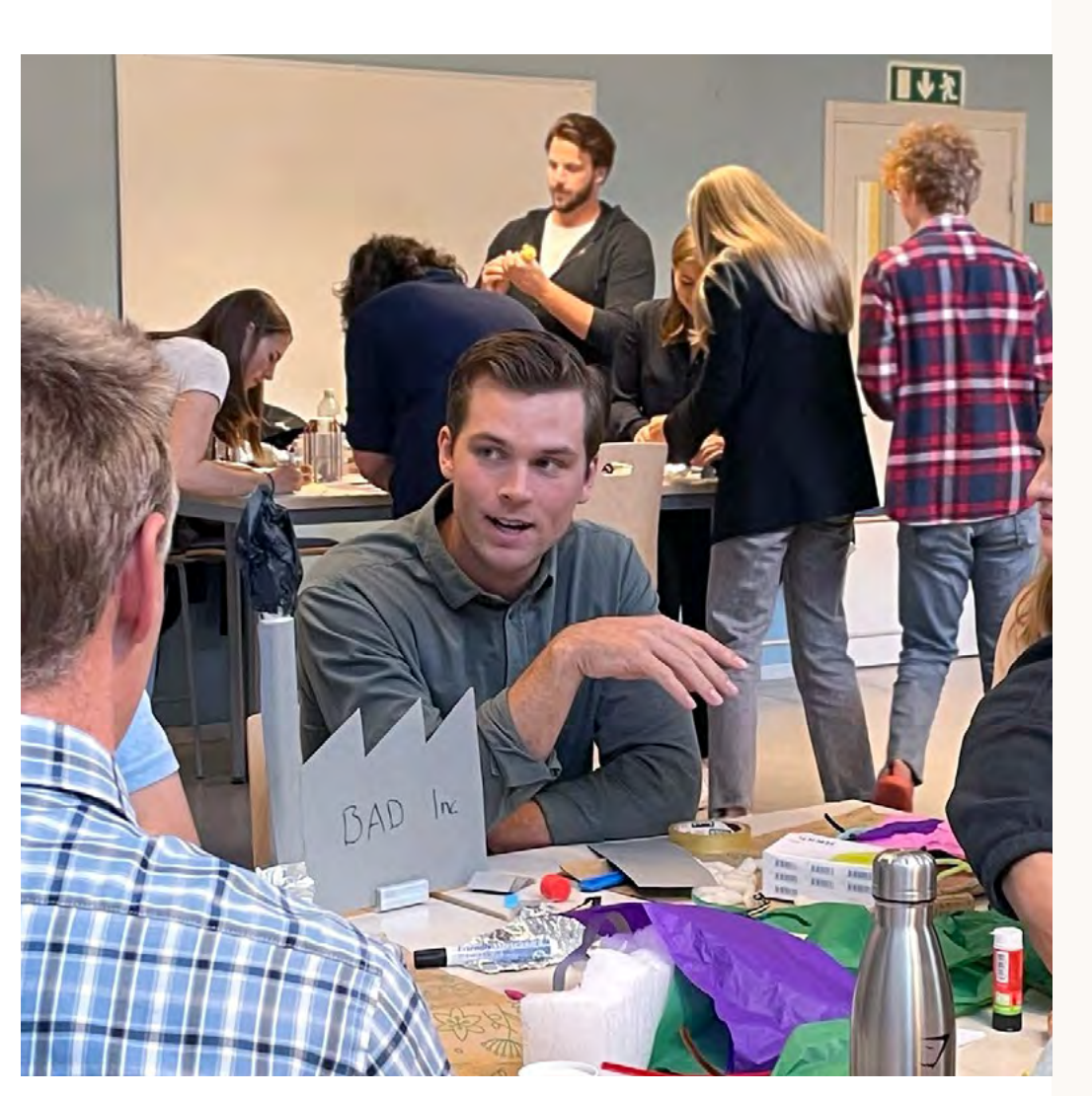
Students during the "shitty prototyping workshop".