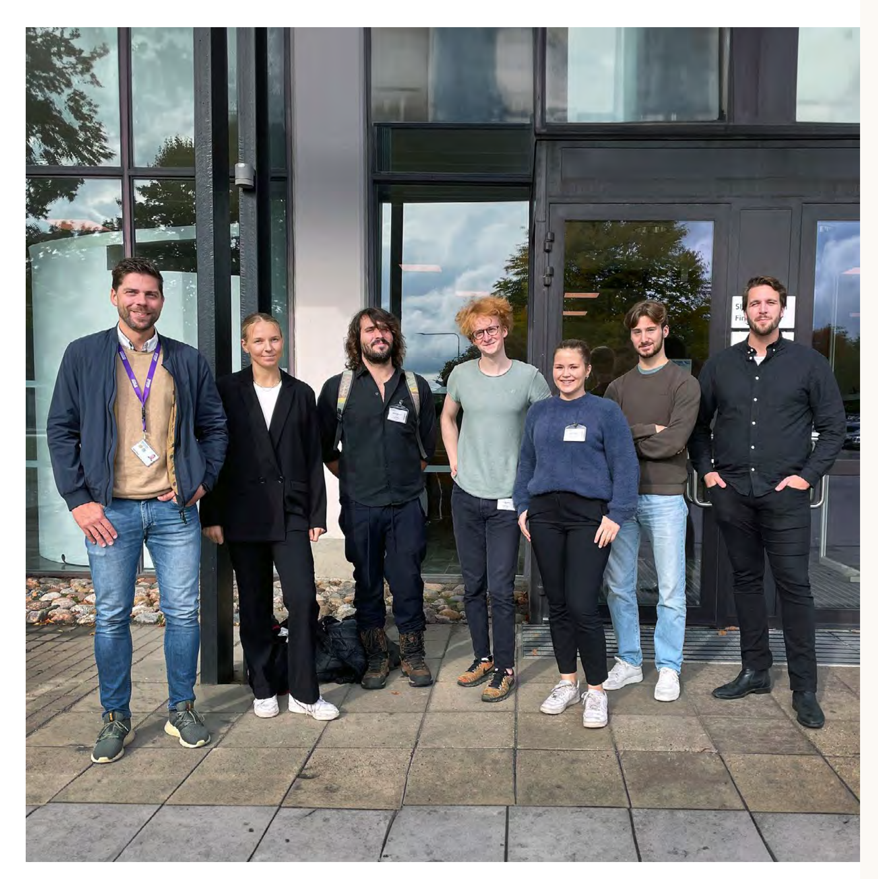
Student group visiting challenge provider Siemens Energy in Finspång.